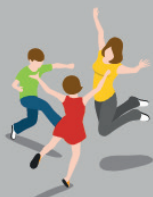
People working with youngsters