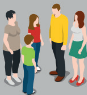
People linked with youngsters