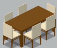
Focus Groups Interviews